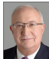
Manuel Trajtenberg Israel