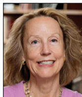
Anne Catherine Case Princeton University