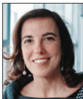
Eliana La Ferrara Italy