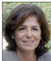
Lucrezia Reichlin Italy