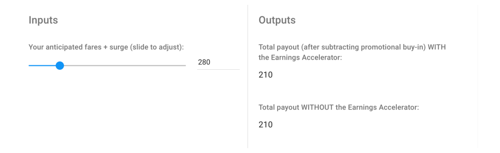
Figure A2: Taxi Slider

Note: This is a picture of one of the sliders sent to drivers who were offered a Taxi contract. Each slider was programmed to load at the breakeven point. Drivers could either slide the slider at the left or type in a number for their anticipated fares+surge to the right of the slider.