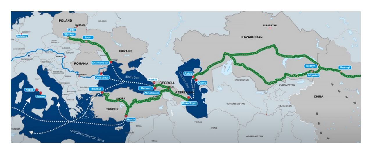
Figure 4: Middle Corridor Routes, March 2022

either crossing the Black Sea from Georgia to enter the EU through Romania or Bulgaria, or crossing the Adriatic to avoid passing through non-EU members in southeast Europe. Changes of transport mode lengthen the journey, reducing the benefits of rail over sea.<sup>23</sup> In March 2022, two Middle Corridor routes in common use ran from Baku either to a Georgian port and by sea to Constanta (Romania) or to Kars and then by rail to Istanbul or Mersin. In the short term, there are issues with coordinating documentation and rules (e.g. what constitutes a hazardous material shipment) among the countries and operators involved; by contrast, such issues had been long resolved on the China-Kazakhstan-Russia-Belarus-Poland route. Prior to Russia's invasion of Ukraine, less than 5% of Landbridge traffic used the Middle Corridor.