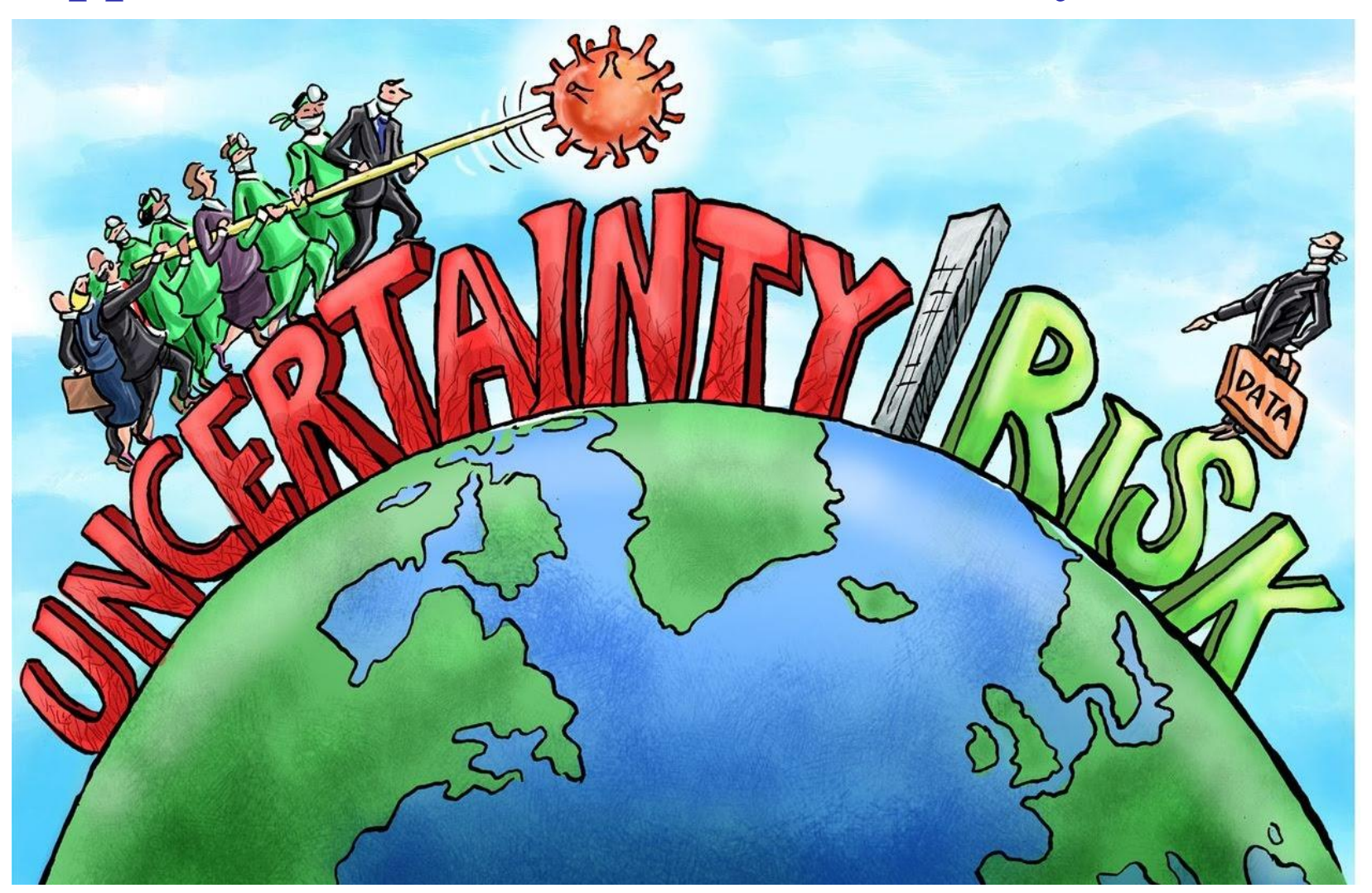
Schrager, A. 2020. Risk, Uncertainty and Coronavirus. Wall Street Journal, March 23, 2020.