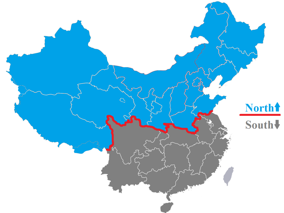
Figure 1: Map of Northern and Southern China

It is widely perceived that northern China has substantially worse air quality than southern China, and these perceptions are verified in the AQI data. Indeed, the differential heating policy in North and South leading to pollution level differences has been previously utilized to identify the effect of air pollution on mortality (Almond, Chen, Greenstone and Li, 2009; Chen, Ebenstein, Greenstone and Li, 2013). A natural question for our study of lottery gambling is whether individuals in northern and southern China respond similarly to short-term variation in pollution with respect to lottery ticket purchase decisions. Figure 1 shows the definition of northern and southern China, which is the commonly acknowledged official definition.<sup>8</sup>