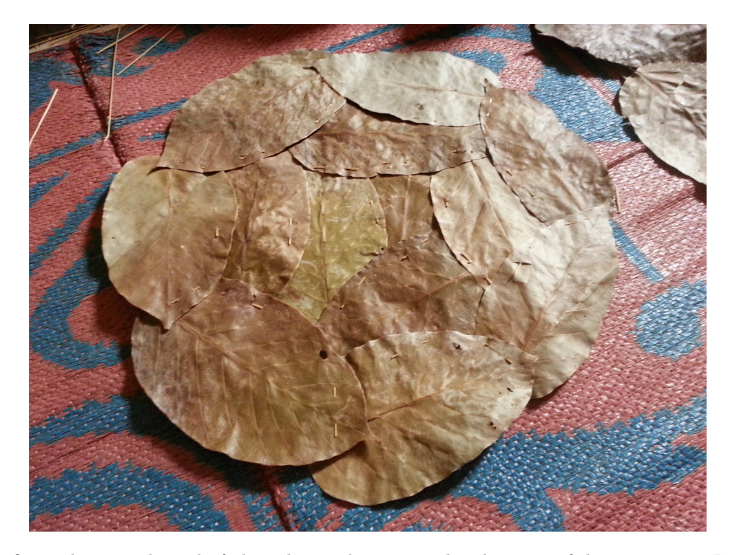
Figure 1: Leaf plate

Notes: This figure shows a sal tree leaf plate akin to the ones produced as part of the experiment. In accordance with quality standards asked for by contractors in the area, leaf plates were required to (i) meet a minimum size requirement, (ii) have no gaping holes, (iii) have all leafstalks (petioles) covered by other leaves, and (iv) have the inner center parts placed underneath the outer rings of the plates.