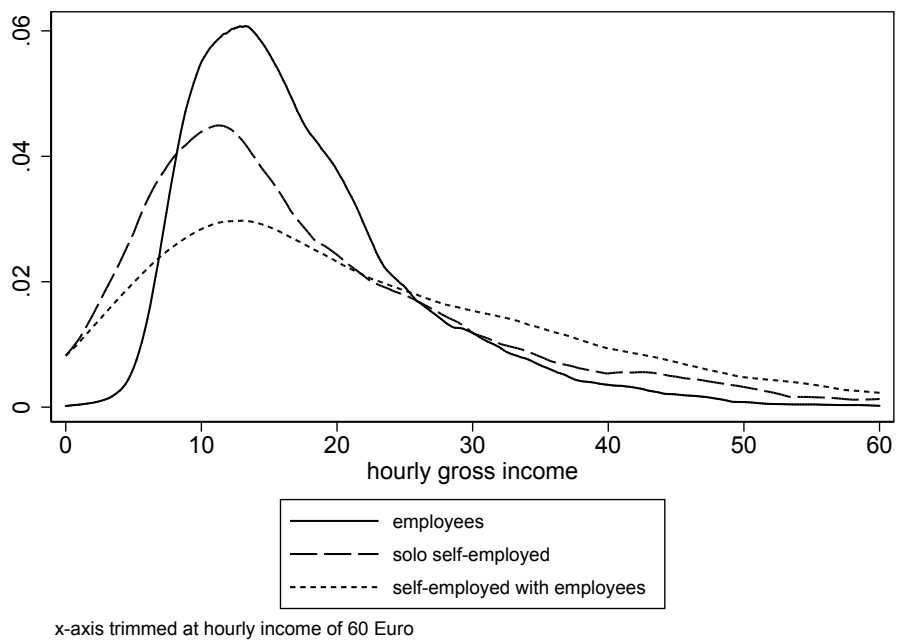
Figure 2: Kernel density estimates of hourly income by employment status