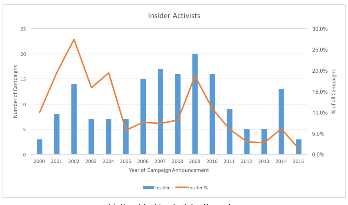
(b) Quasi-Insider Activist Campaigns