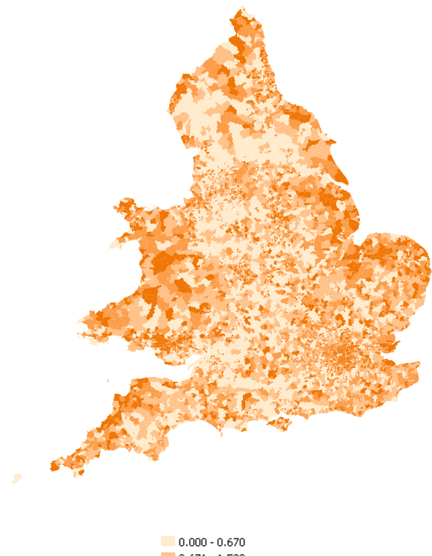
Figure A1 Unemployment to vacancy ratios in England and Wales Shades correspond to quartiles.