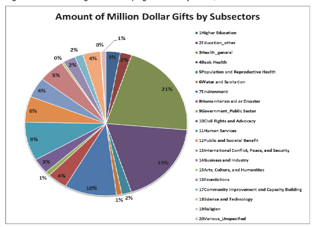
Figure 4: Million dollar gifts to developing countries by cause, 2000-10

Note: Publicly announced gifts; MDL database.