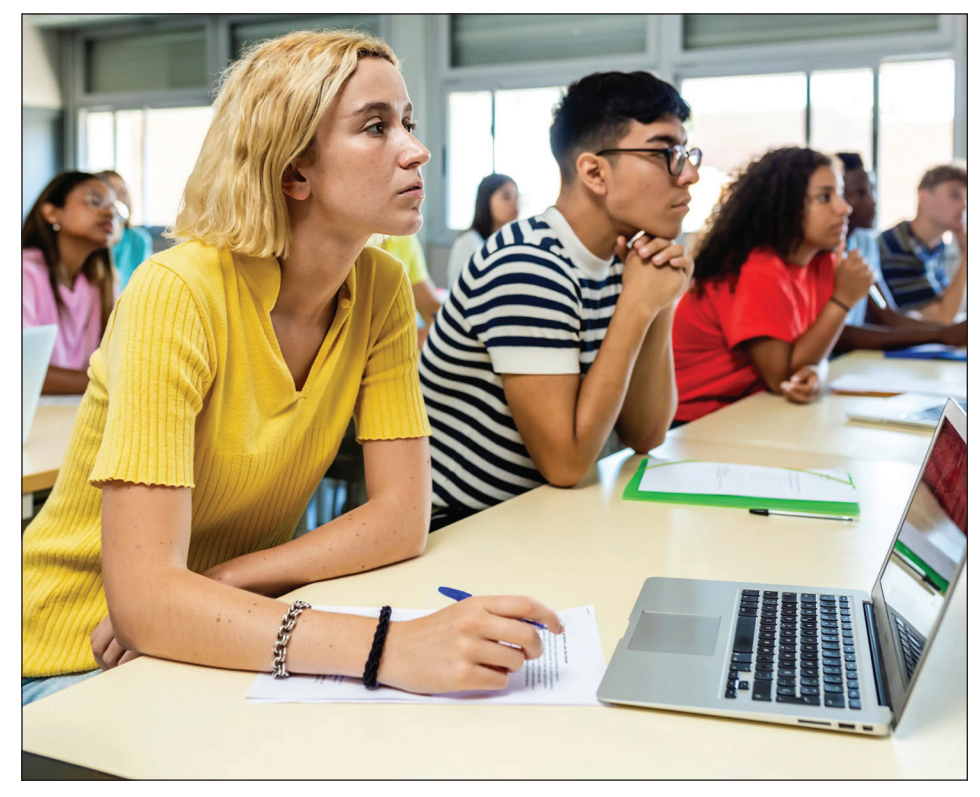
The number of undergraduate economics degrees awarded in the United States increased by 79 percent between 2001 and 2021. During this time, the share of female degree recipients has remained stagnant, averaging around one-third of all economics bachelor's degrees.

The gender gap in economics degree completion begins early in college. Women are less likely than men to take introductory economics courses, and female students may be more sensitive than males to their economics course performance when choosing to take subsequent coursework and selecting a major