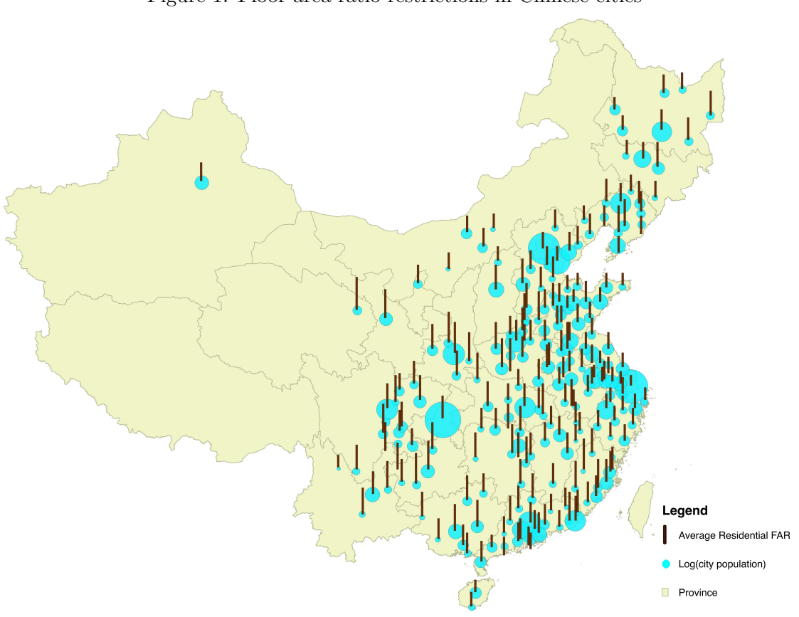
Figure 1: Floor area ratio restrictions in Chinese cities

Note: The size of the circle represents the 2010 population of the city; the height of the bar represents average maximum allowed floor area ratios in the city over different years.