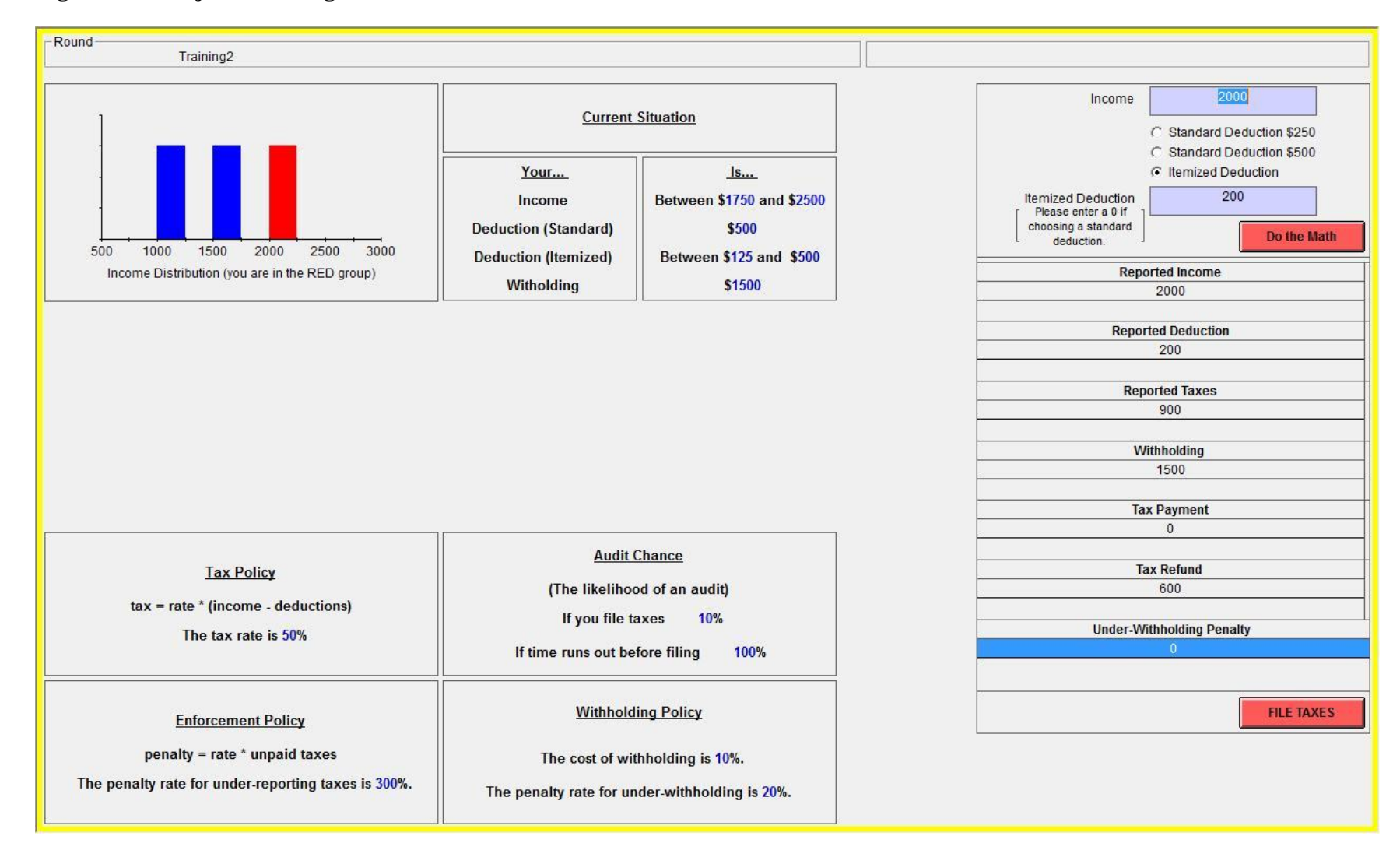
Figure A.3 Subject tax filing screen