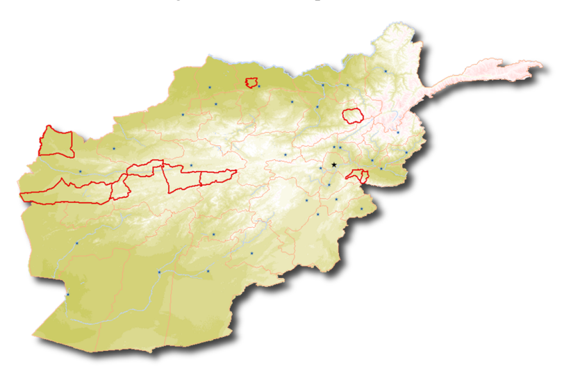
Figure 1 - Ten Sample Districts