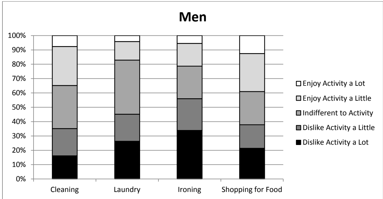
Figure 1 Preferences by Gender and Activity